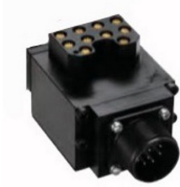
Master Cylinder model SWRZ0H0-M